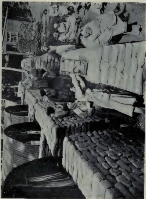
W.A.A.C. Encampment protected by sand-bags.